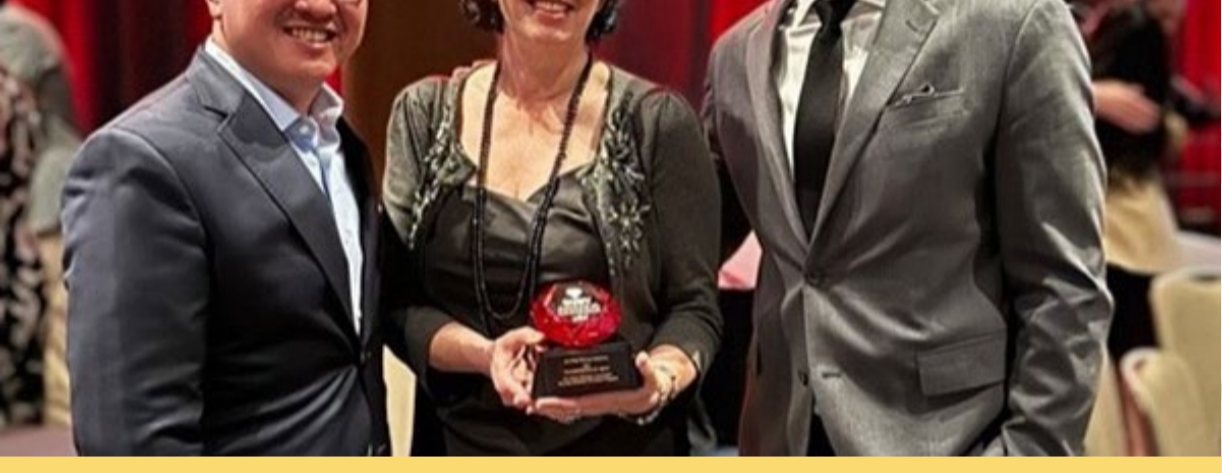
Innovative Government Agency Award San Diego Housing Federation Ruby Awards Ceremony June 7, 2024

Our DEI policy statement is also available on the DEI page on our website at sdhc.org/about-us/diversity-equity-and-inclusion/