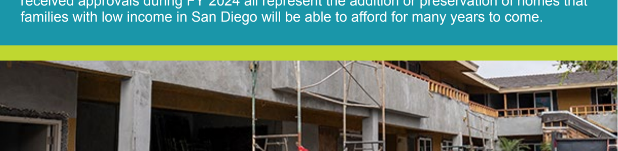
Pacific Village Conversion of Former Hotel into Housing June 18, 2024

The new units completed, the units for which ground was broken, and the projects that received approvals during FY 2024 all represent the addition or preservation of homes that families with low income in San Diego will be able to afford for many years to come.