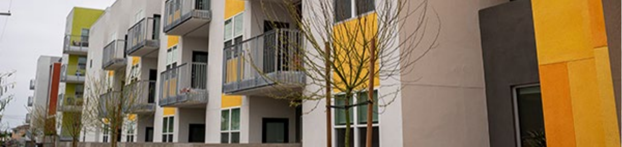
Puesta del Sol 59 Affordable Apartments for Seniors Grand Opening: May 2, 2024