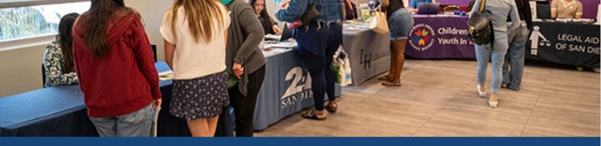
Housing Resource Fair Jackie Robinson Family YMCA June 5, 2024