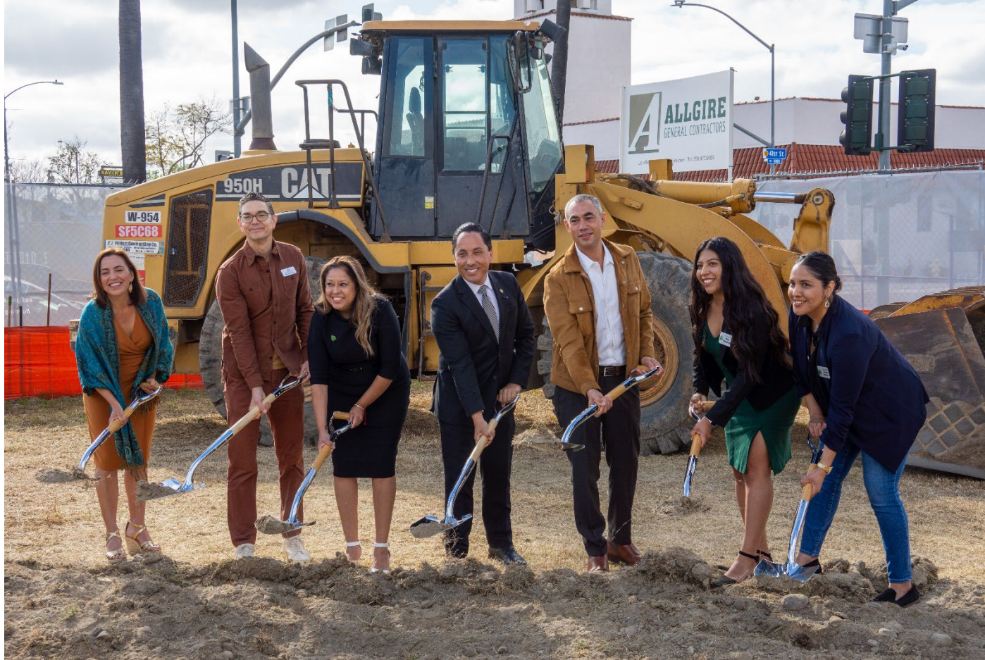
Site #1 4050 El Cajon Boulevard