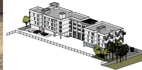
Site #4 4102-4122 University Avenue