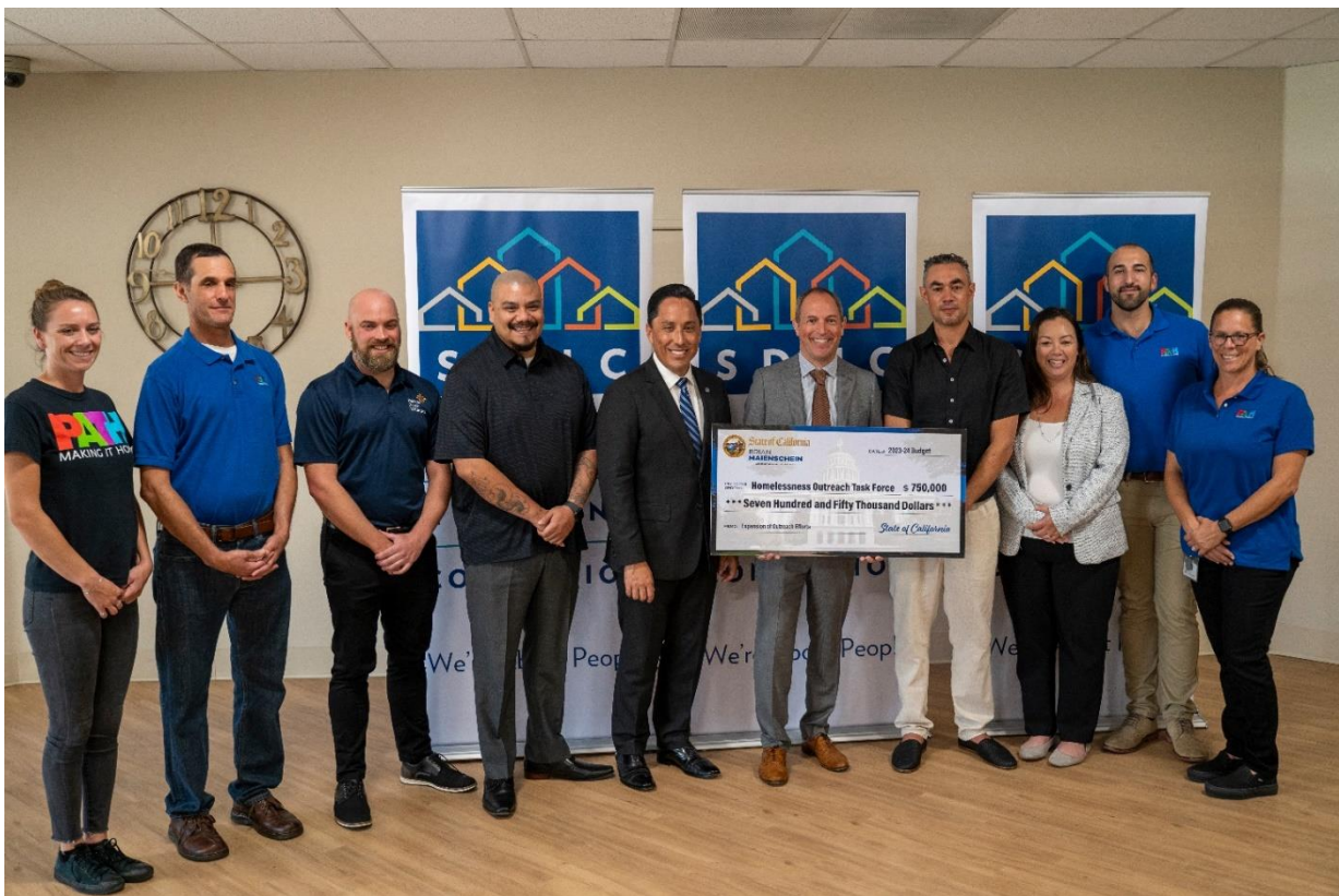
Multidisciplinary Outreach Program – State Funding Announcement October 5, 2023