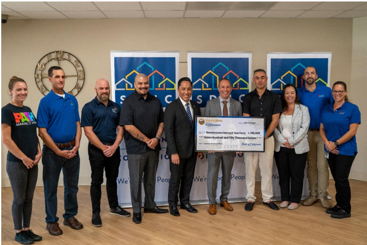
Multidisciplinary Outreach Program – State Funding Announcement October 5, 2023