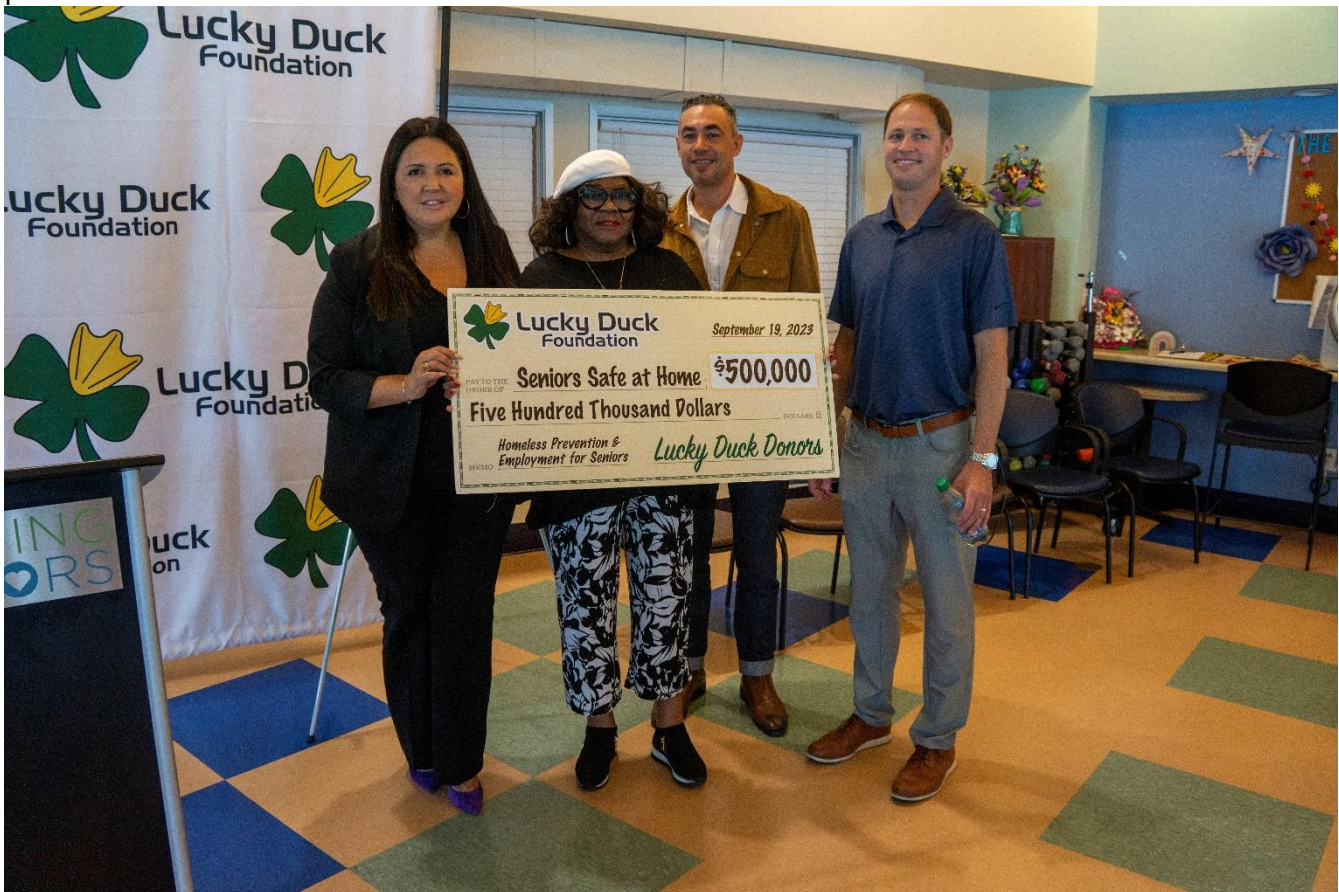
“Seniors Safe at Home” Announcement September 29, 2023

The Lucky Duck Foundation is investing $500,000 in philanthropic funds to make this program possible.