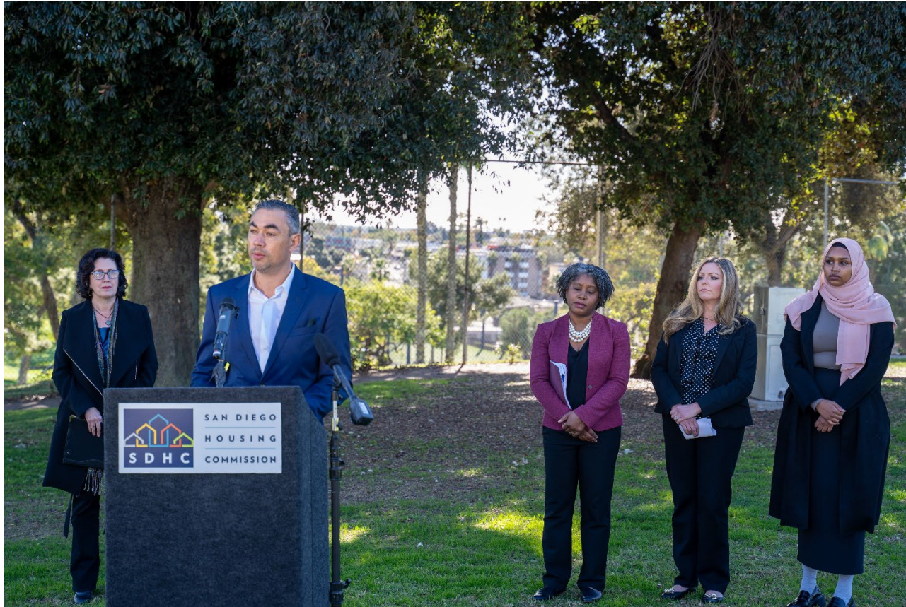
Residential Eviction Study News Conference January 11, 2024