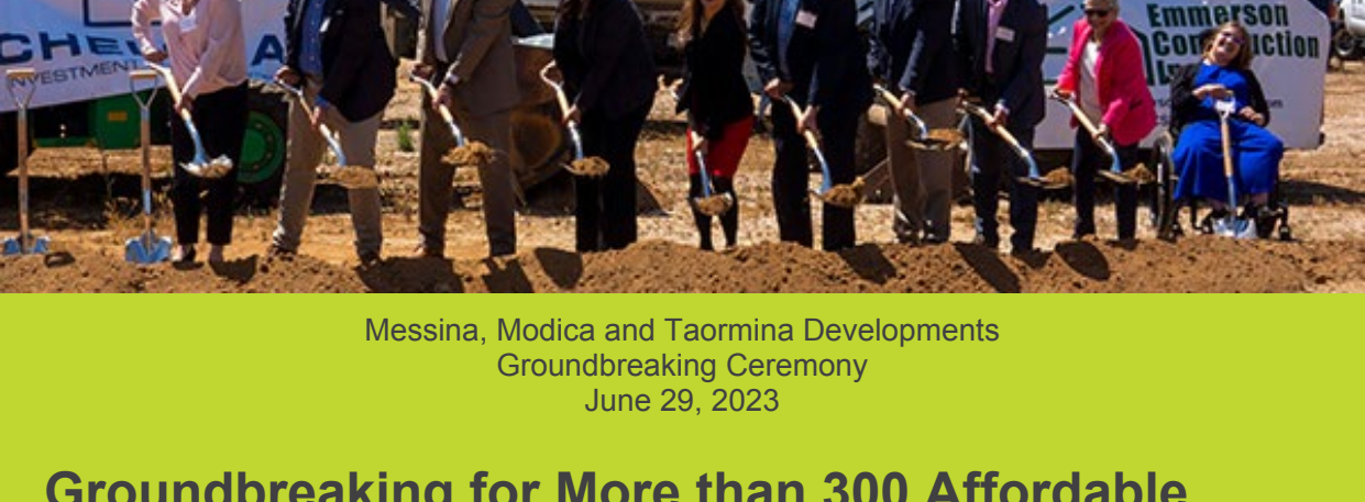
Messina, Modica and Taormina Developments Groundbreaking Ceremony June 29, 2023

Read the County of San Diego News Release