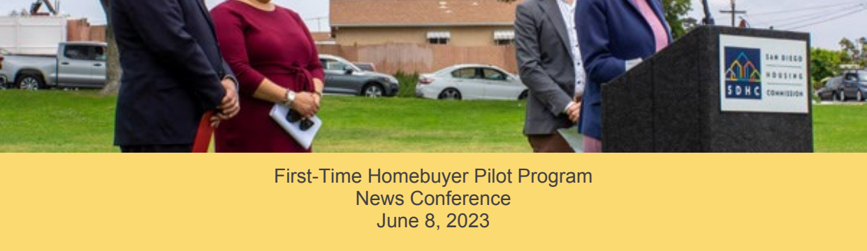
First-Time Homebuyer Pilot Program News Conference June 8, 2023