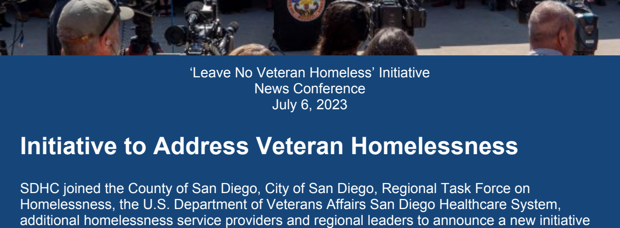
‘Leave No Veteran Homeless’ Initiative News Conference July 6, 2023

I invite you to read more about these activities in this newsletter, along with recent recognitions for two SDHC collaborative affordable housing developments.