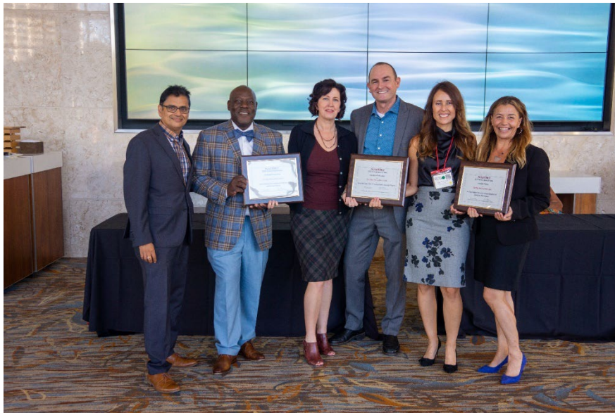
NAHRO Awards of Merit Presented to SDHC