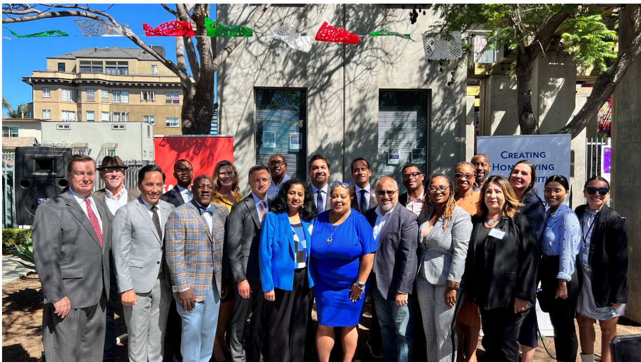
Wealth Opportunities Restored through Homeownership (WORTH) Grant News Conference September 21, 2022

Wells Fargo is working to increase racial equity in homeownership. Nationally, WORTH aims to help create 40,000 new homeowners of color by the end of 2025.