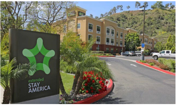
3860 Murphy Canyon Road Council District 7