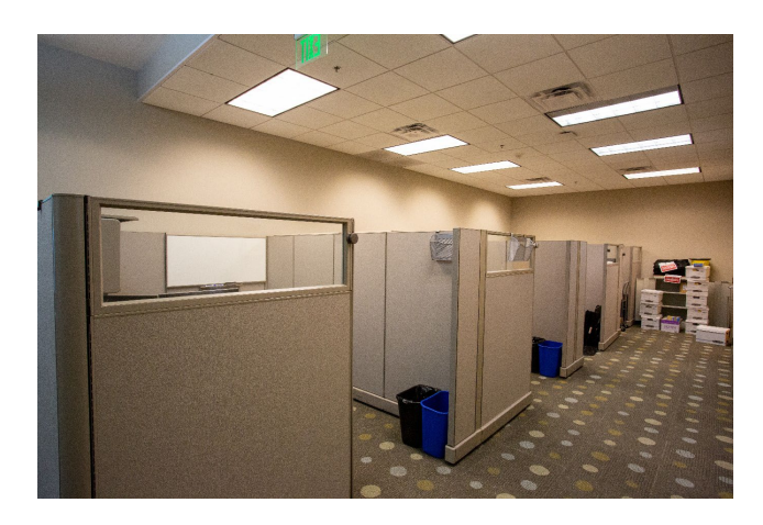
Current Cubicle Spaces