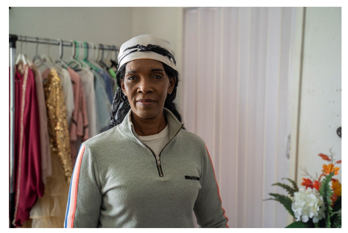
Carmel Housing Instability Prevention Program Participant