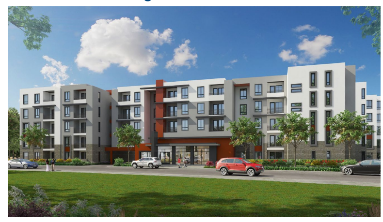
Rendering – Modica Façade Design Intent. General representation of the building elevation. Final product is subject to change.