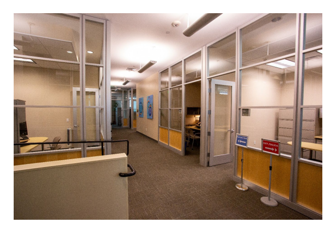
Current Office Spaces

Potential shelter at SDHC office building