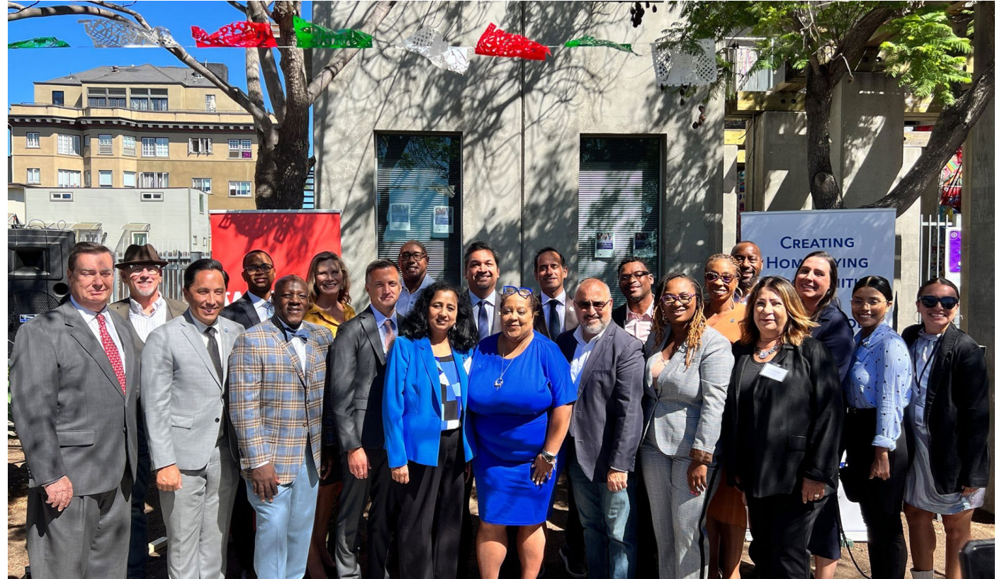
Wells Fargo Grant Announcement September 21, 2022