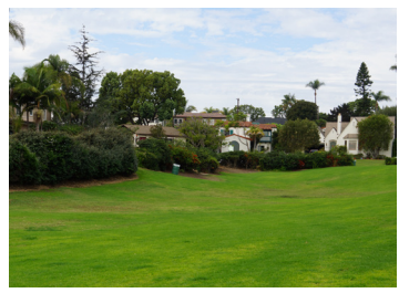
Point Loma Community

SDHC divided City of San Diego (City) ZIP Codes into three groups, each with its own payment standards: