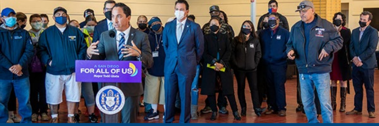
Harm Reduction Homelessness Shelter News Conference December 15, 2021