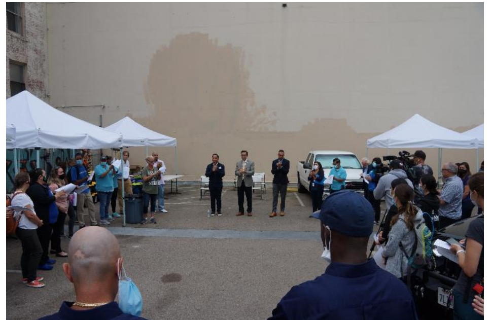
Downtown San Diego Outreach Kickoff June 28, 2021