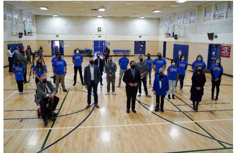
Homelessness Outreach News Conference March 10, 2021