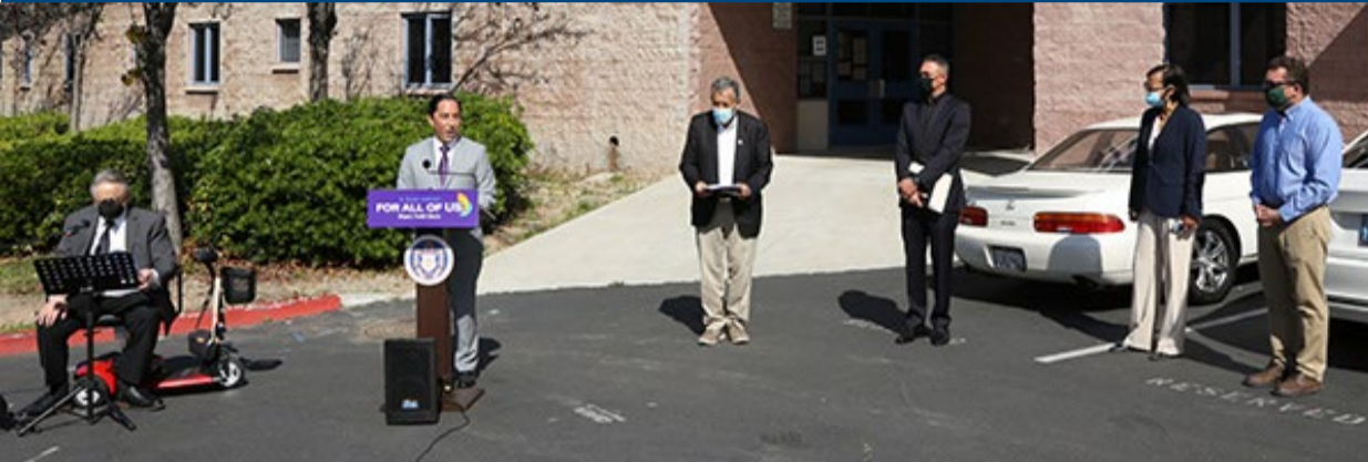
City of San Diego COVID-19 Housing Stability Assistance Program News Conference April 5, 2021

I invite you to read more below about additional recent San Diego Housing Commission (SDHC) activities.