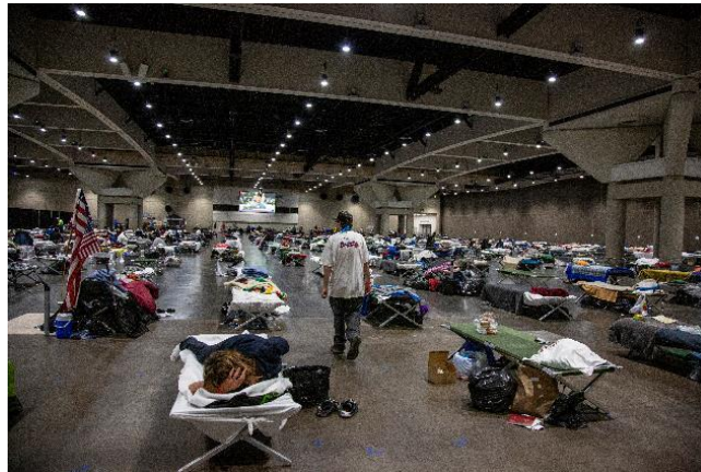
OPERATION SHELTER TO HOME SAN DIEGO CONVENTION CENTER – MAY 28, 2020