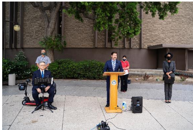
CITY OF SAN DIEGO COVID-19 EMERGENCY RENTAL ASSISTANCE PROGRAM NEWS CONFERENCE – JUNE 2, 2020

As of November 25, 2020, the Housing Commission disbursed $13,590,000 to assist 3,673 households that consist of more than 10,700 individuals. The Housing Commission fully expended all of the funds designated for one-time rental assistance payments through this program. However, the program was oversubscribed. An additional 45 households qualified for assistance. In December, to make one-time rental assistance payments for these 45 qualifying households, the Housing Commission utilized funds that had been budgeted for program administration but were unexpended. As of December 23, 2020, all of the 45 additional qualifying households received assistance.