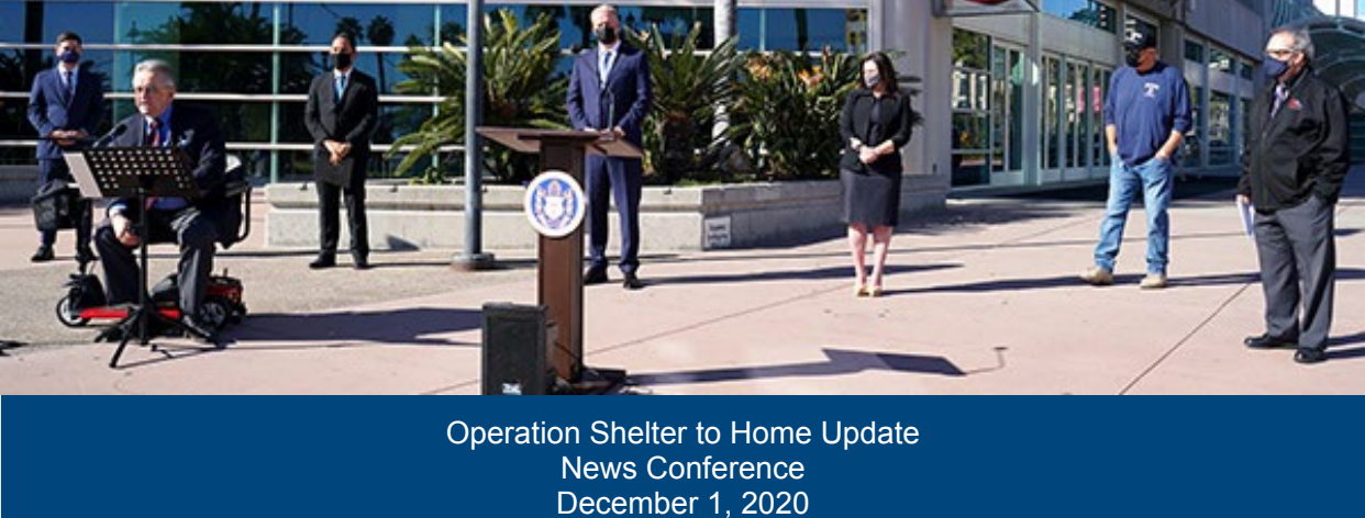
Initiative on Track to Help Nearly 1,100 Individuals

I invite you to read more about these activities below.