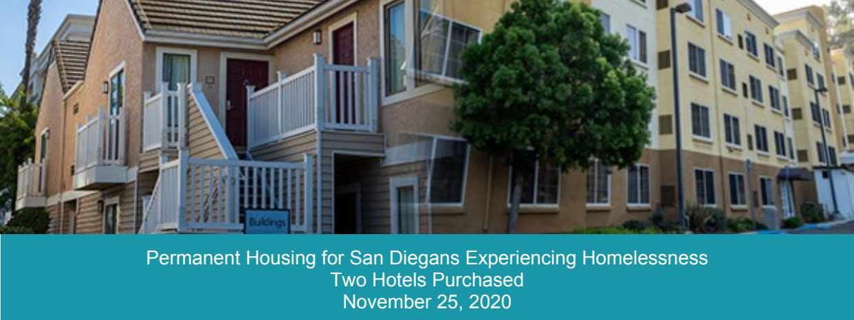
purchasing two hotels. SDHC completed the purchases on November 25, 2020, and has been preparing the properties for move-ins since then.

These properties provide 332 furnished units in good condition. Many of the households who