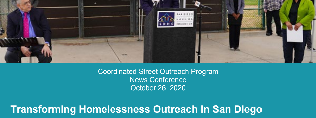
Coordinated Street Outreach Program News Conference October 26, 2020