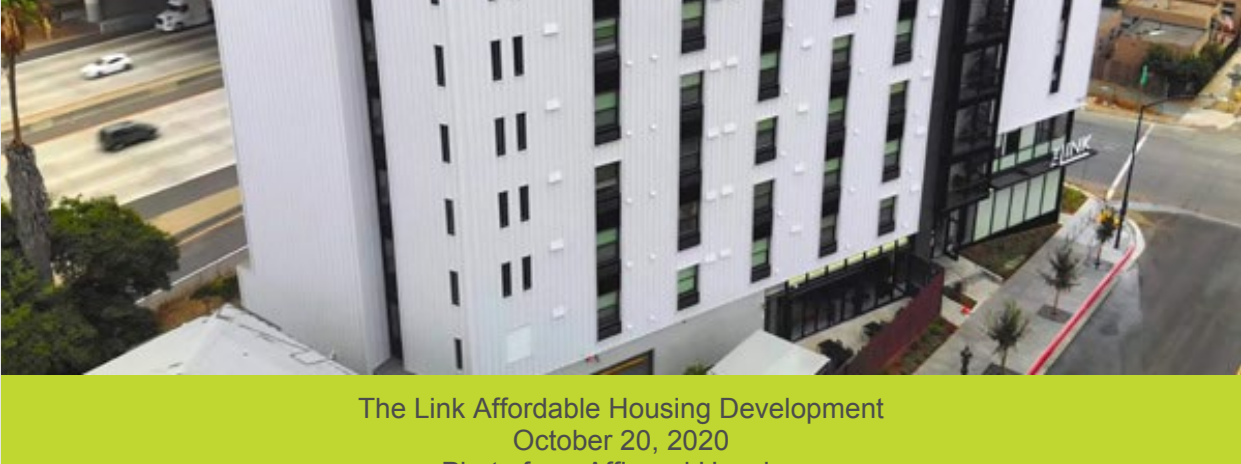
The Link Affordable Housing Development October 20, 2020