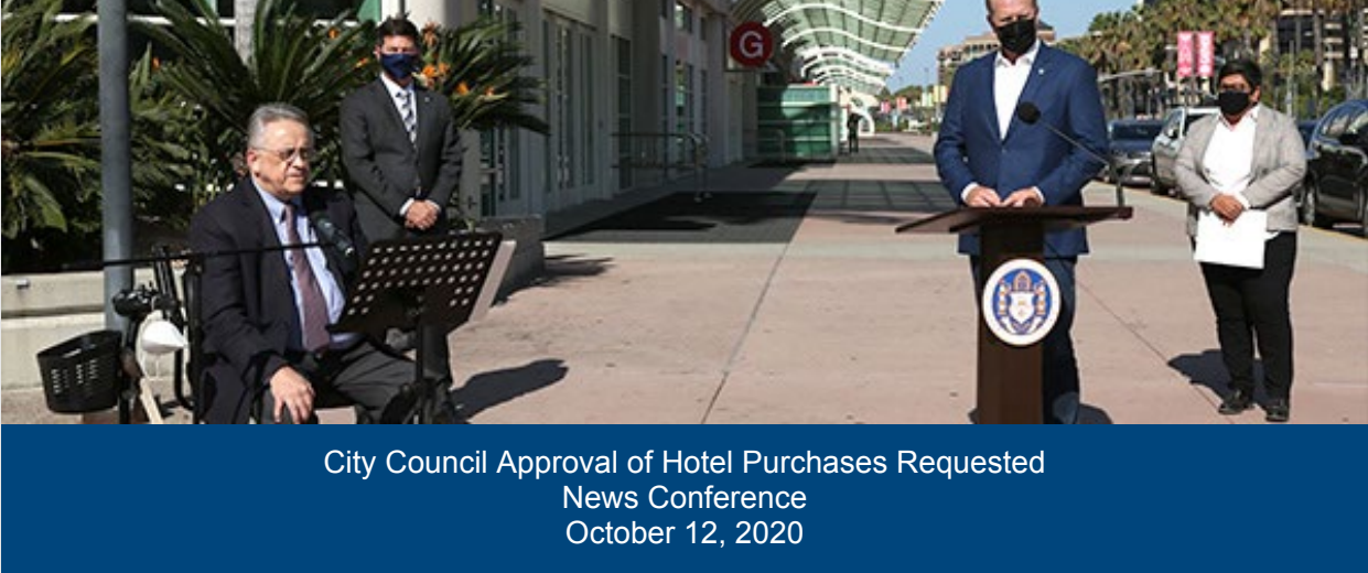
City Council Approval of Hotel Purchases Requested News Conference October 12, 2020