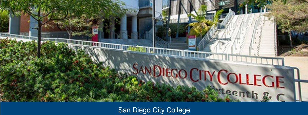
San Diego City College Homelessness Program for Engaged Educational Resources (PEER) October 13, 2020