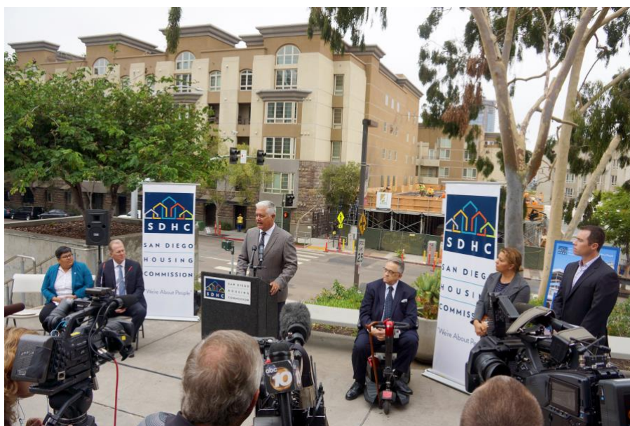
SDHC Notices of Funding Availability News Conference – September 4, 2018

The available development funding consists of: