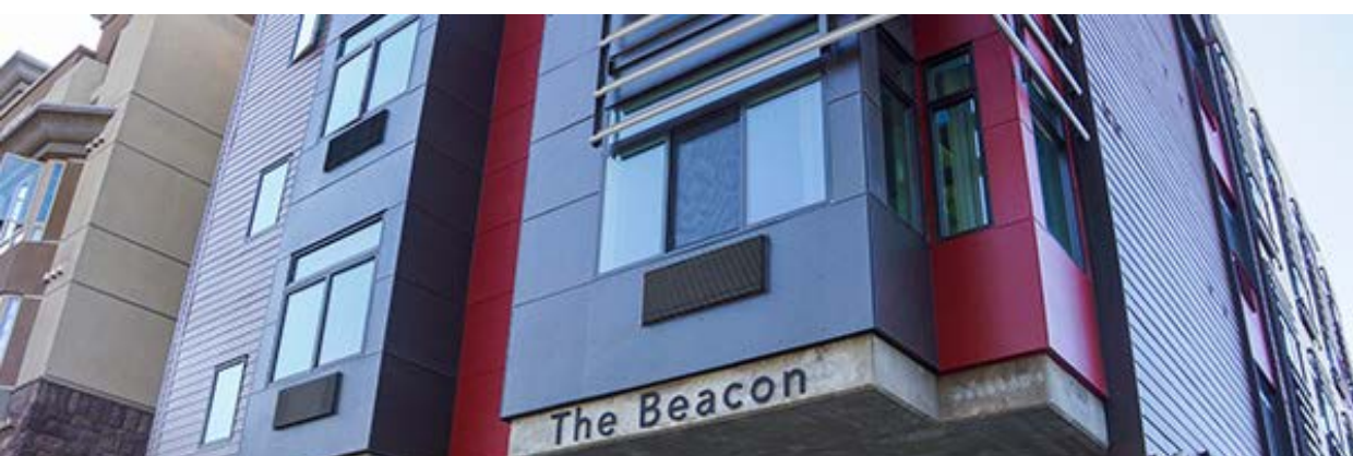
The Beacon Grand Opening SDHC Partnership Development September 20, 2019

I invite you to read more below about these SDHC activities.