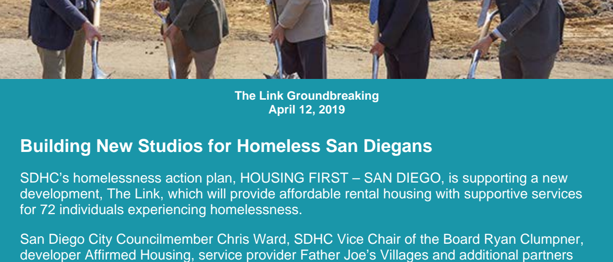
with income up to 50 percent of the San Diego Area Median Income. SDHC awarded 72 rental housing vouchers to the development through HOUSING FIRST –