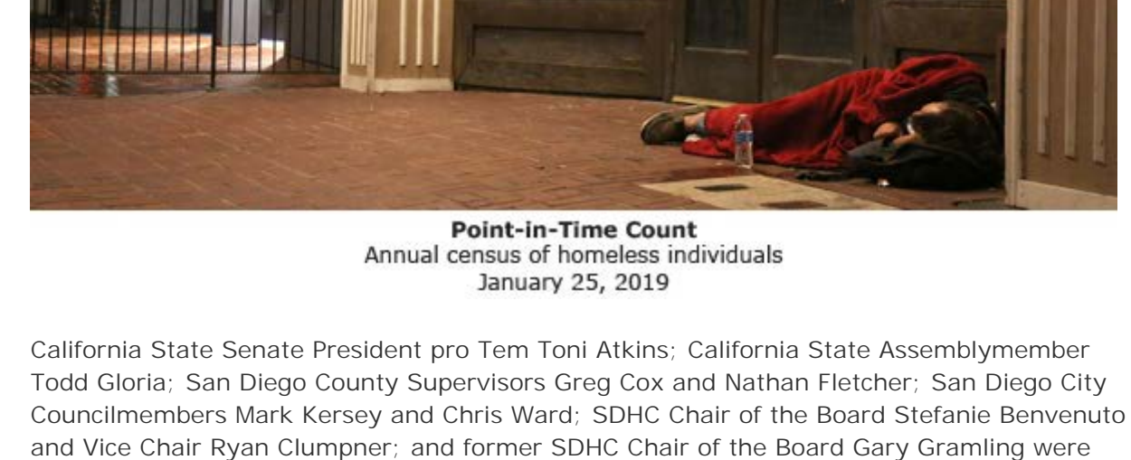
Coordinated by the Regional Task Force on the Homeless, the Point-in-Time Count is essential to securing about $20 million in Federal Continuum of Care funding from the U.S.

In the early morning hours of January 25, volunteers conducted the annual Point-in-Time