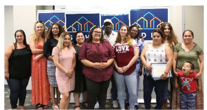
Power of One Program Graduation SDHC Achievement Academy July 9, 2018