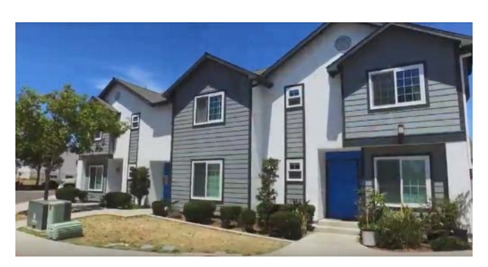
Fulton Street Upgrades

Completed Fiscal Year (FY) 2017 and 2018 capital improvements consisting of new windows, sliding doors, paint, fencing, roofing, building systems, cabinet preservation, and landscaping that impacted approximately 4,700 residents.