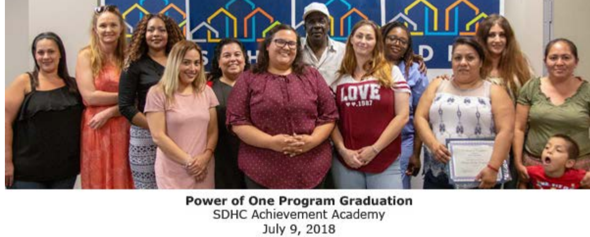
Power of One Program Graduation SDHC Achievement Academy July 9, 2018

The SDHC Achievement Academy hosted a celebration for the second graduating class of its Power of One program , a yearlong program that assists single parents who receive federal rental assistance and have children up to age 16.