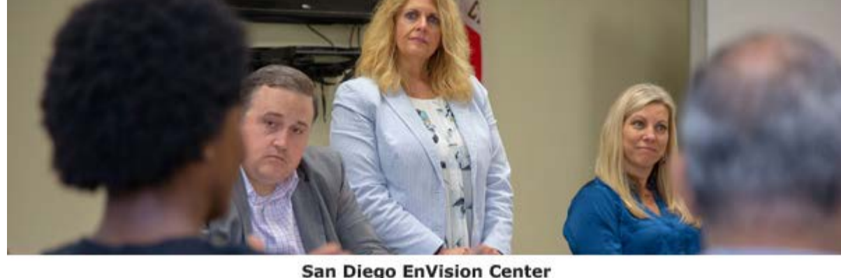
San Diego EnVision Center Resident Roundtable Meeting July 25, 2018