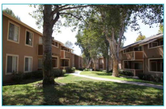
The new Smoke-Free Policy prohibits smoking anywhere at SDHC-owned residential properties.

Before moving forward with the policy, SDHC surveyed tenants, and a majority who responded to the survey said they prefer a smoke-free living environment.