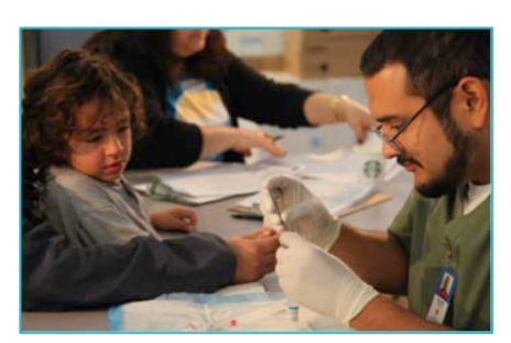
SDHC Blood-Lead Level Testing King-Chavez Primary Academy, 2.26.13

Blood-lead levels can be detected easily with noninvasive portable Lead Care II blood analyzers bought by SDHC in 2010. The blood analyzers require only a small pinprick to a child's finger and provide results within three minutes.