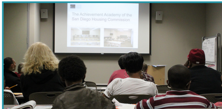
SDHC Achievement Academy classes

Landlords will be informed of any changes to their rental payments. Be assured, if you do not receive a letter this year, you