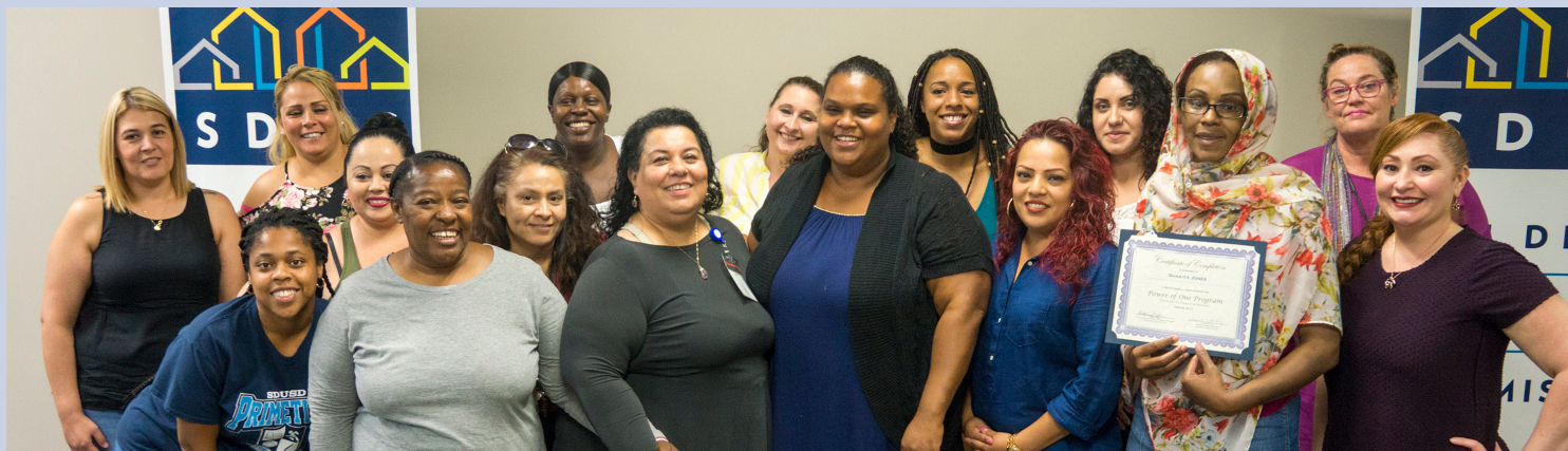
Power of One Graduation Ceremony 7.14.17

“I hear other people and see their struggles and seeing how far they’ve come, and it just gives me hope that I’ve also been able to accomplish a lot of stuff myself. I can get to where I set my mind to. My goals – I can make those reality,” she said.