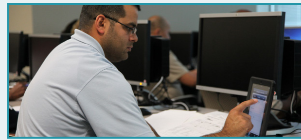
Mobile App Training for SDHC Inspectors

SDHC previously modified the inspection procedure in 2009 to place qualified units on a biennial inspection schedule. To qualify for the biennial inspection schedule, a unit was required to pass its HQS inspection on the first visit two times in a row.