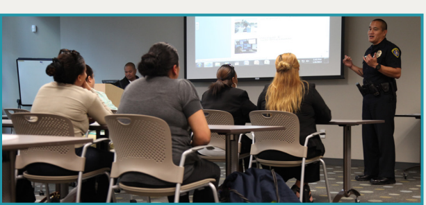
San Diego Police Department Recruitment at the SDHC Achievement Academy

For more information about Path to Success, please visit www.sdhc.org.