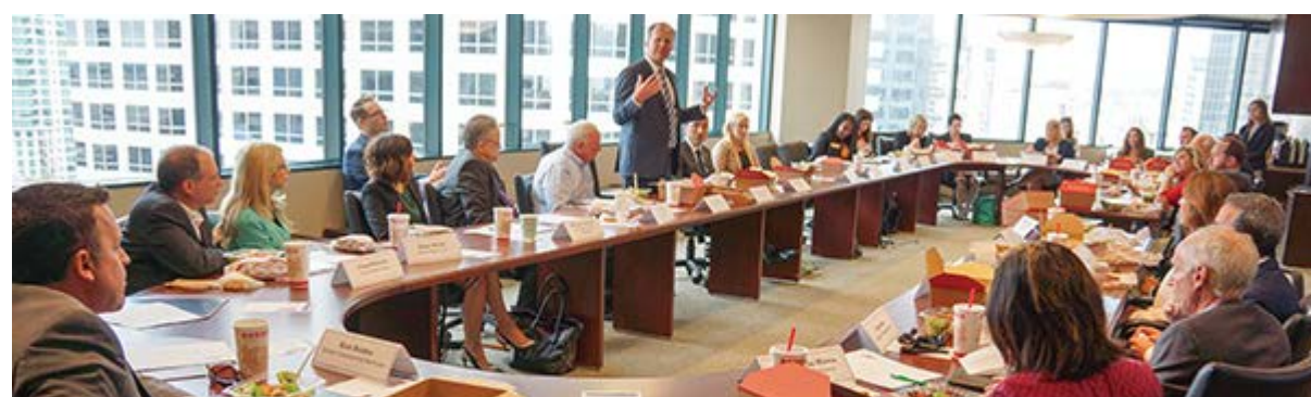
Mayor Kevin L. Faulconer's "Housing Our Heroes" Landlord Outreach Meeting April 6, 2016

I was honored to join U.S. Department of Housing and Urban Development (HUD) Secretary Julián Castro, San Diego Mayor Kevin L. Faulconer, and business leaders from across the U.S. on a national conference call about homelessness.