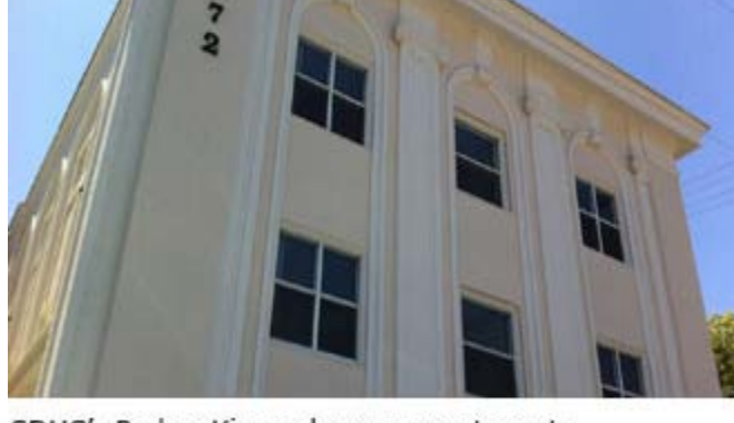
SDHC's Parker-Kier welcomes new tenants.