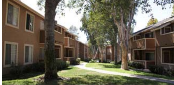
The new smoke-free policy will prohibit smoking at SDHC-owned residential properties.