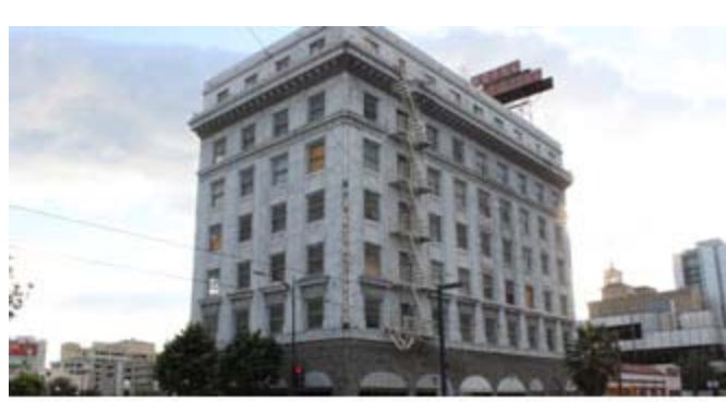
Hotel Churchill will become permanent affordable housing for low-income residents.

Built in 1914, Hotel Churchill is a seven-story, 94-unit building along the San Diego Trolley line in downtown San Diego that has been vacant since 2005. But it will come to life as permanent affordable housing for low-income residents such as seniors and veterans.