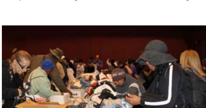
Among the Major Donations Cleary Company - 1,000 pairs of shoes; SDG&E - 1,200 first-aid kits; ResMed - 1,200 backpacks; Coca-Cola Company - 1,150 bottles of water

More than 550 volunteers and 71 service providers came together to serve the homeless, providing clothing, shoes, haircuts, dental exams and many other services—all free of charge.