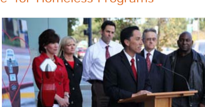
Donation Stations Red, meter-like donation stations make giving to homeless programs easy.

In the spirit of Valentine's Day, SDHC joined the "Show Your Love" campaign, urging San Diegans to donate money at one of the Downtown San Diego Partnership's "donation stations" for homeless programs.