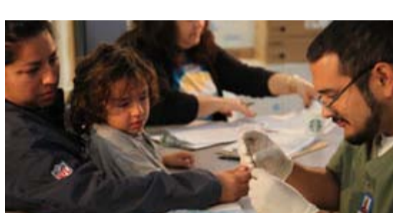
SDHC's "Home Safe Home" Program Children living in homes built before 1978 are considered to be at higher risk for exposure to lead from lead-based paint.

Parents in the Logan Heights community took advantage of free blood testing provided by SDHC's "Home Safe Home" program to detect lead in their children's blood.