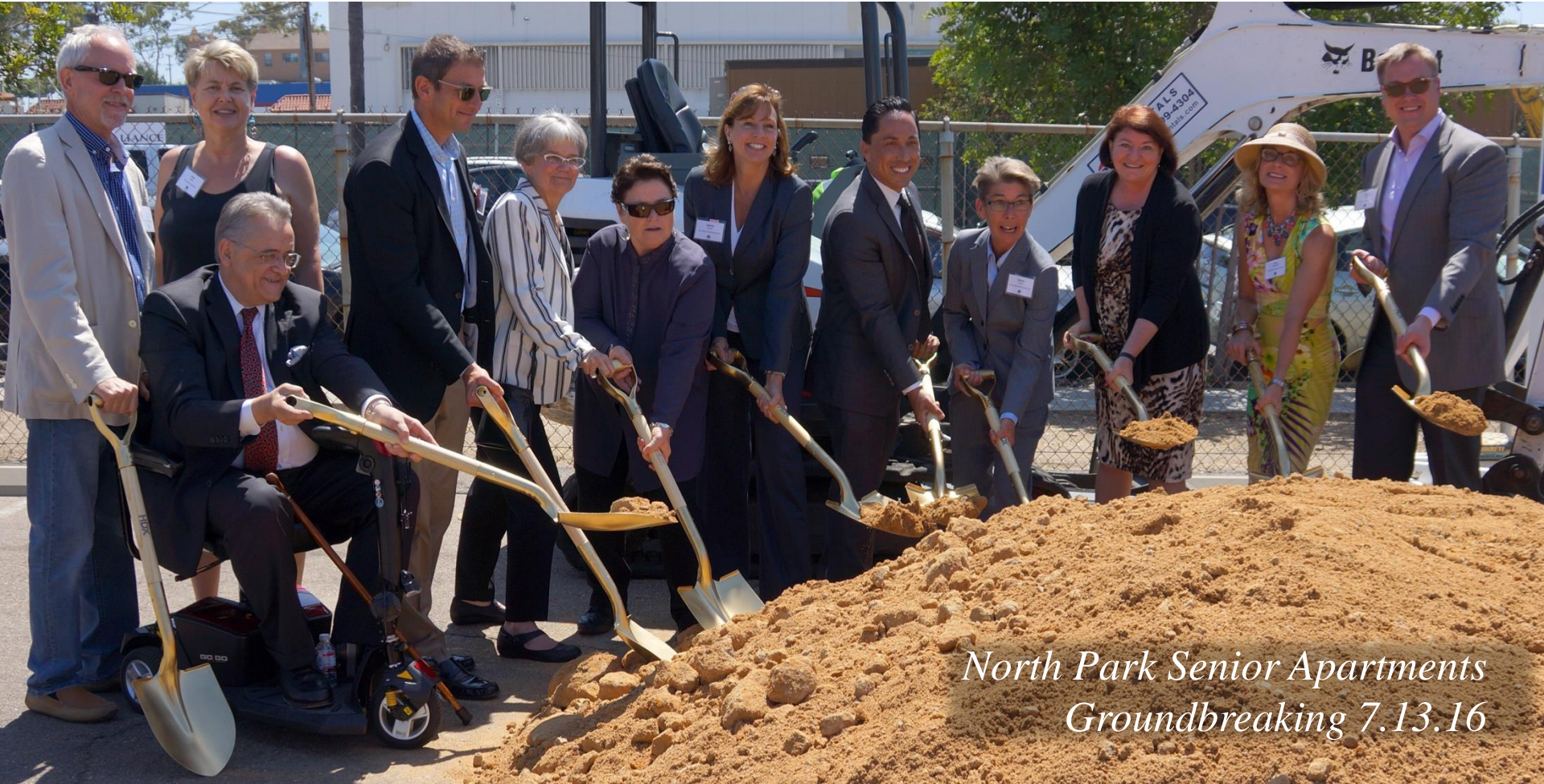
North Park Senior Apartments Groundbreaking 7.13.16

Increase the number of affordable housing opportunities that serve low-income and homeless individuals and families in the city of San Diego