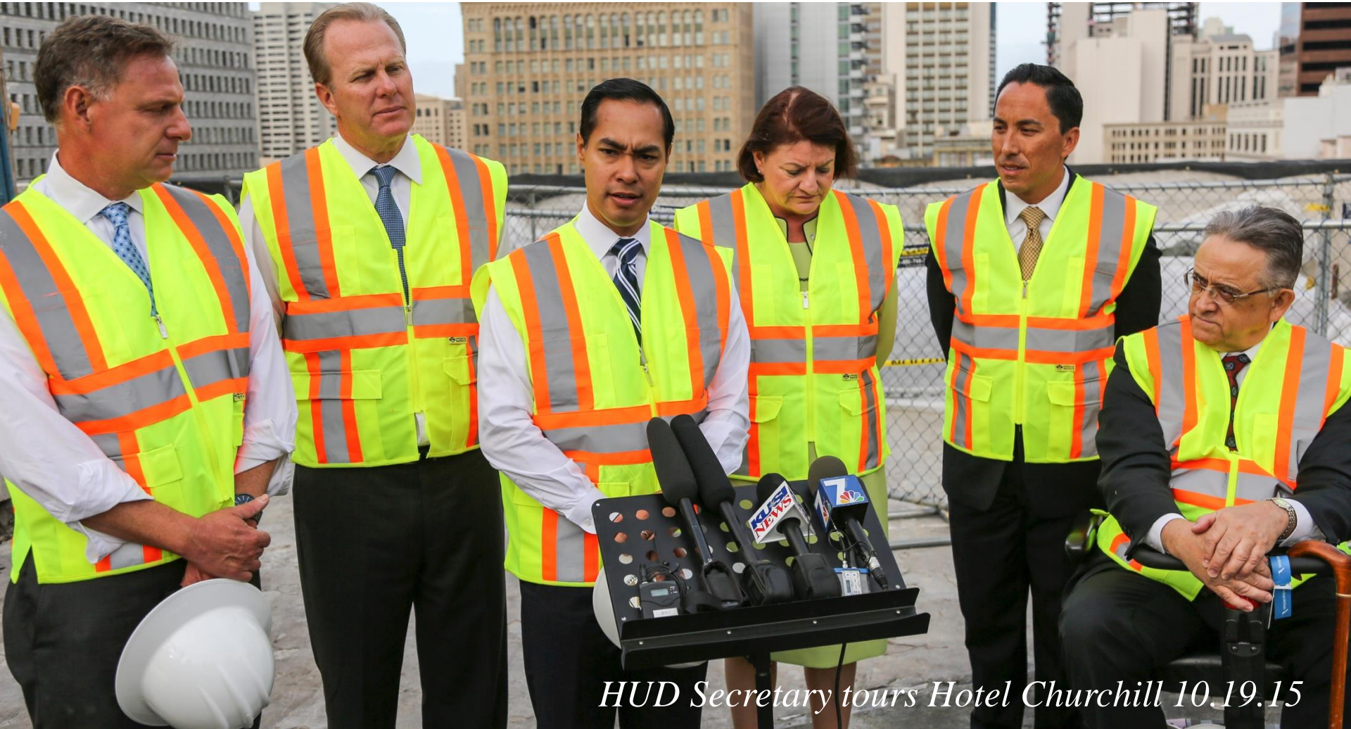
HUD Secretary tours Hotel Churchill 10.19.15

Advocate for more effective affordable housing policies and resources