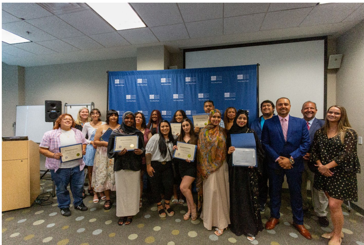
SDHC Achievement Academy's Healthcare Career Catalyst for Young Adults Program Graduation – August 22, 2024