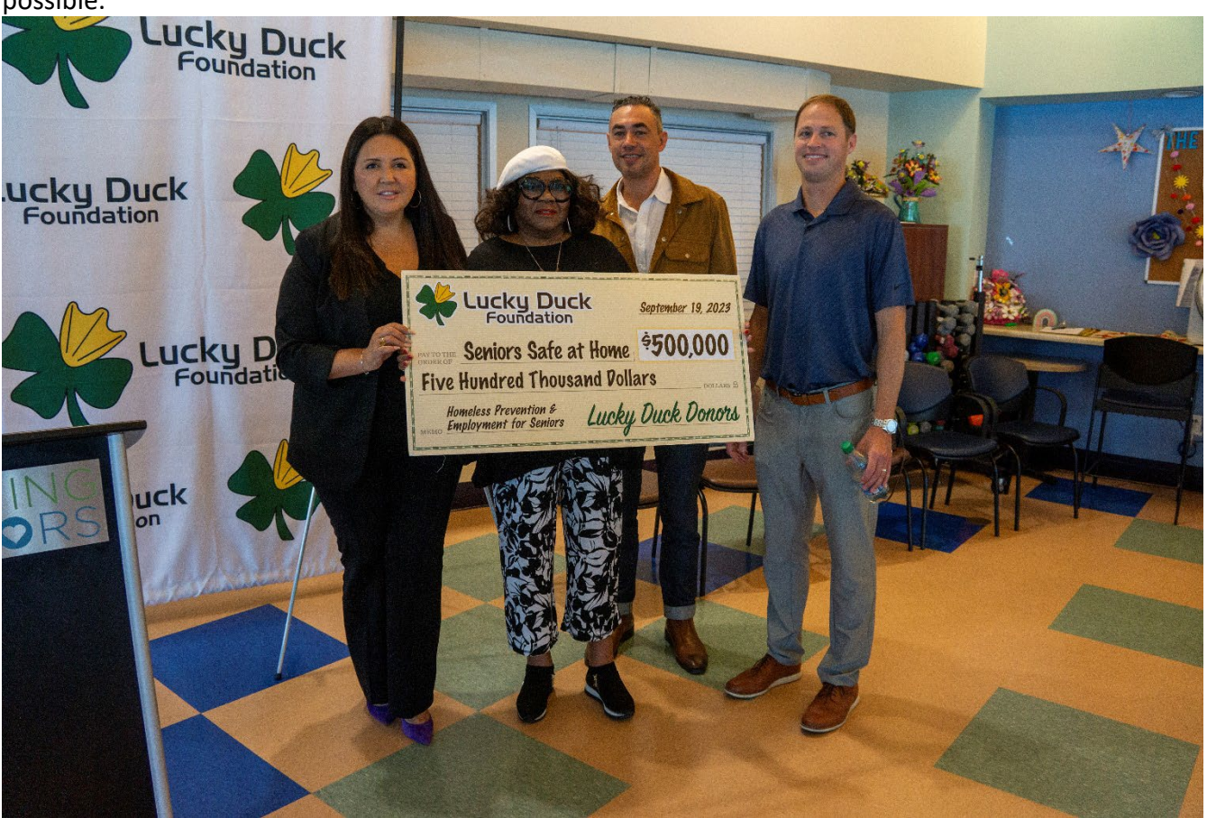
"Seniors Safe at Home" Announcement September 29, 2023

The Lucky Duck Foundation is investing $500,000 in philanthropic funds to make this program possible.