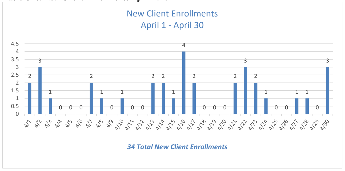
Table One: New Client Enrollments April 2020