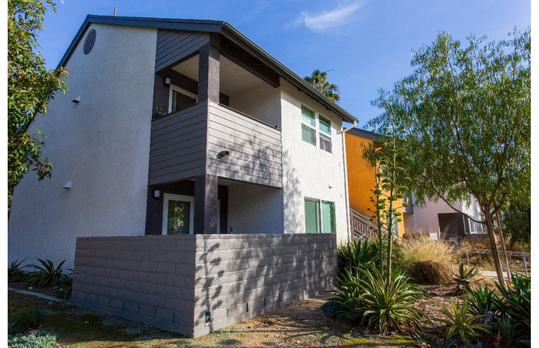
SDHC Affordable Housing Property – Via Las Cumbres