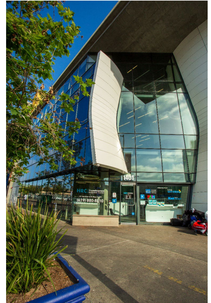
Homelessness Response Center