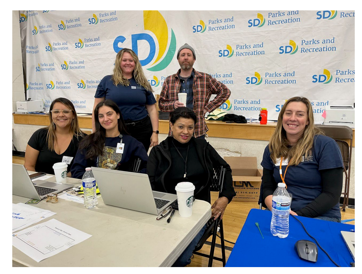
SDHC Homelessness Innovations Staff Local Assistance Center