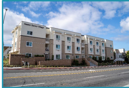
Creating Affordable Housing