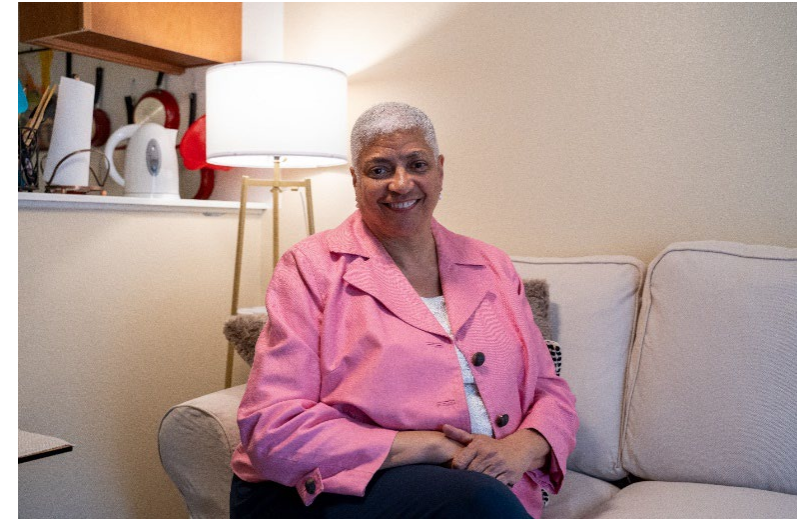
Teri Housing Instability Prevention Program Participant