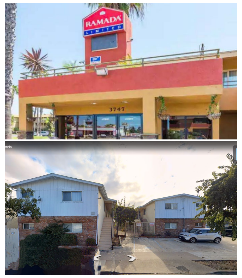
Street view of 2147 Abbott Street

Abbott Street Apartments 2147 Abbott Street, San Diego, CA 92107 Council District 2