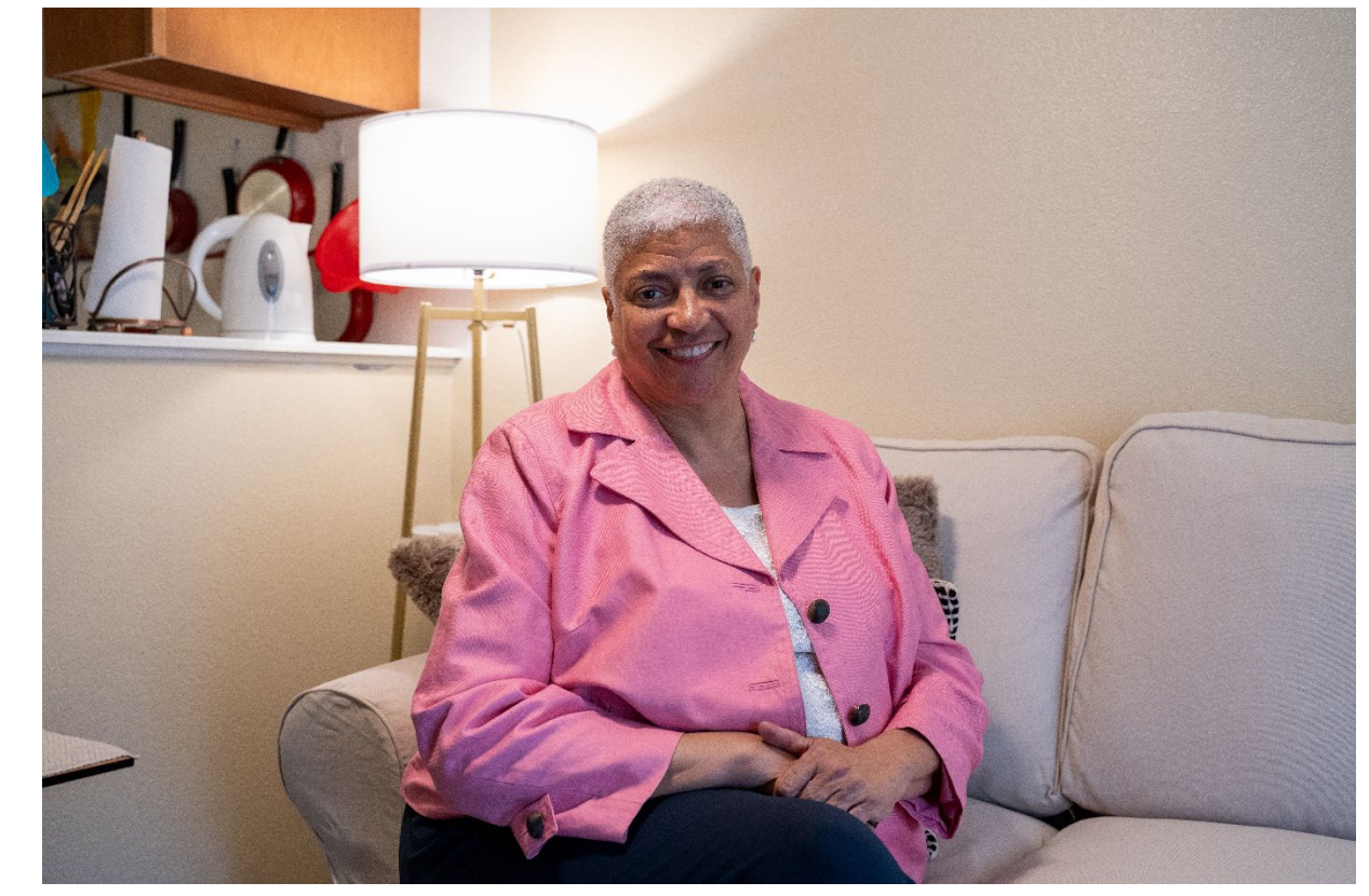
Teri Housing Instability Prevention Program Participant