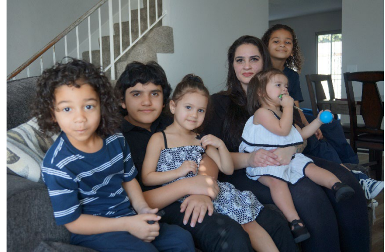
Emergency Housing Voucher Participants