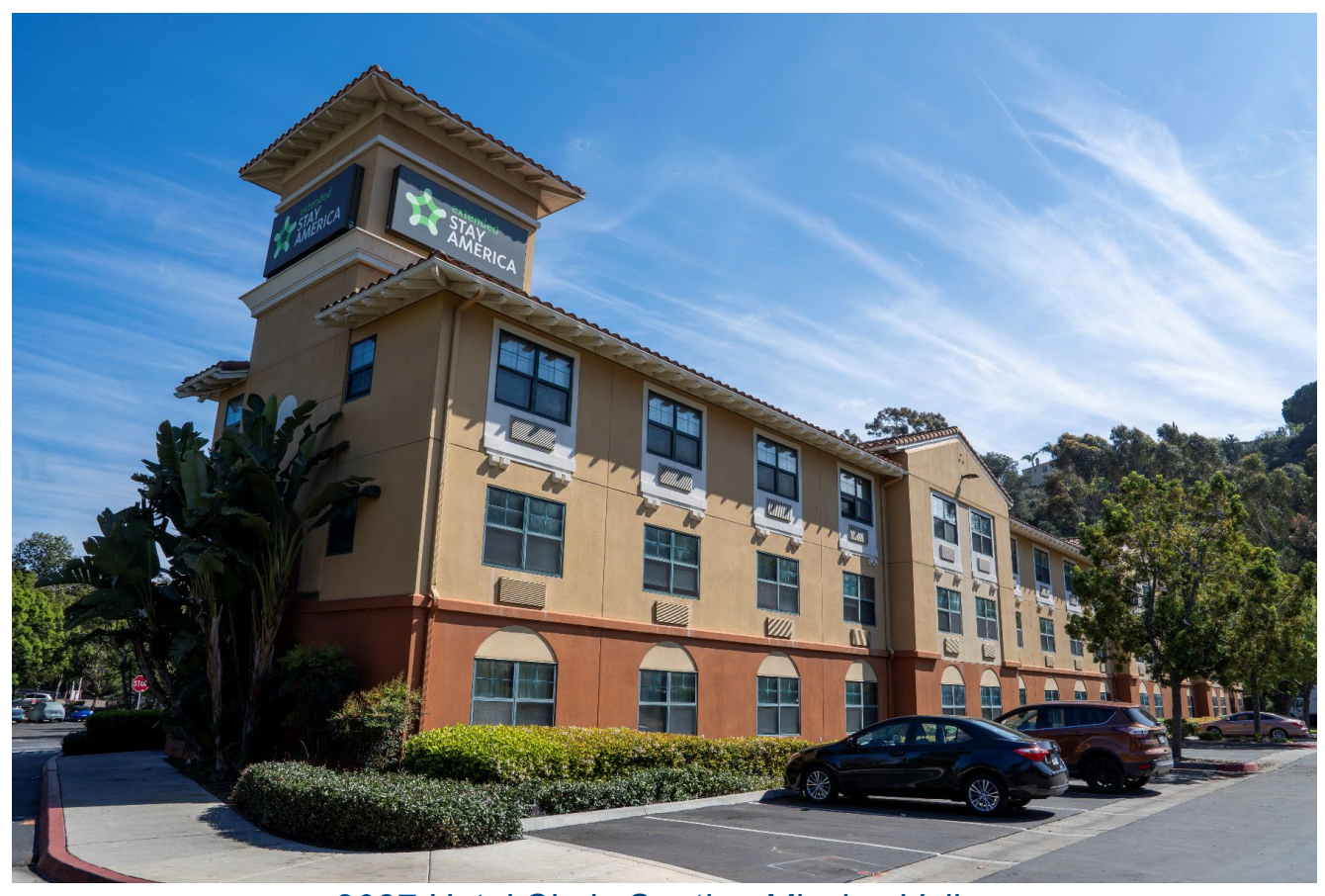
2087 Hotel Circle South – Mission Valley Council District 3