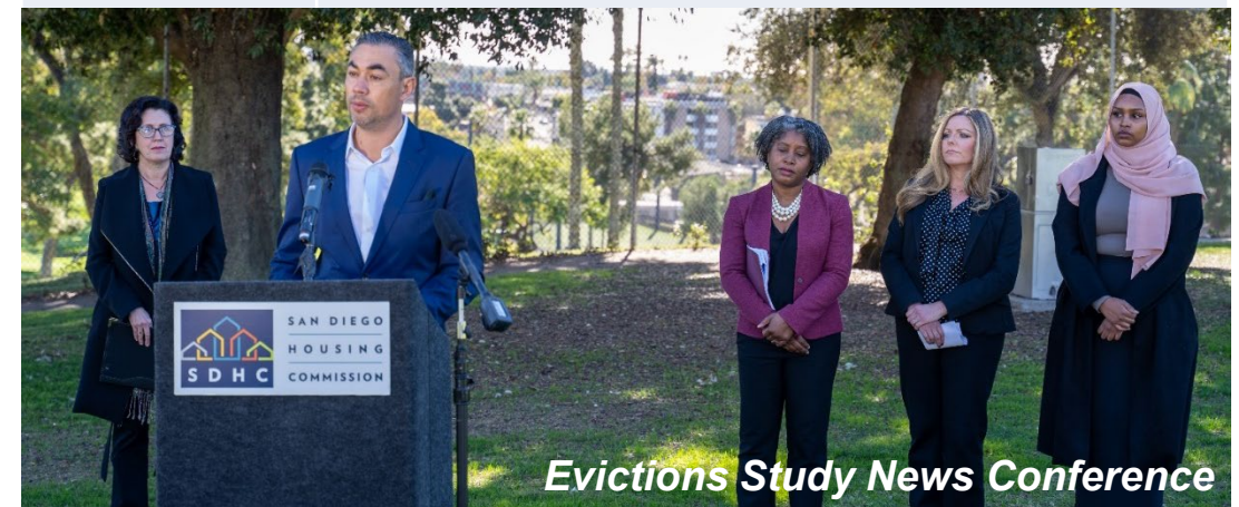
Evictions Study News Conference