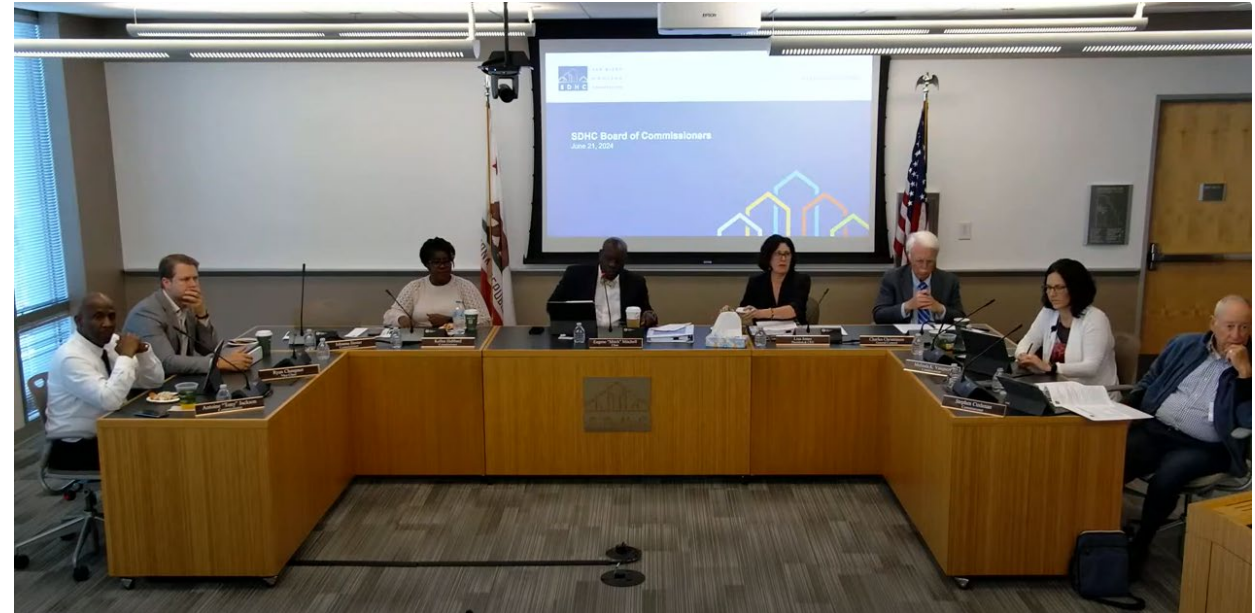
SDHC Board of Commissioners June 21, 2024