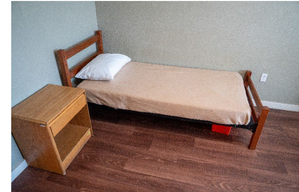
Veterans Village of San Diego Campus