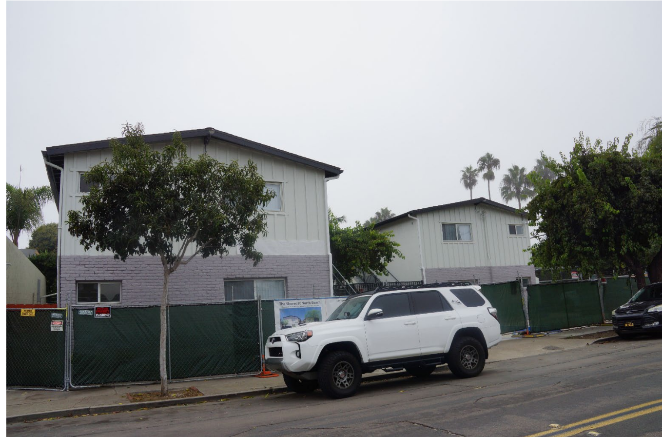
The Shores at North Beach Abbott Street, San Diego, CA 92107 Council District 2