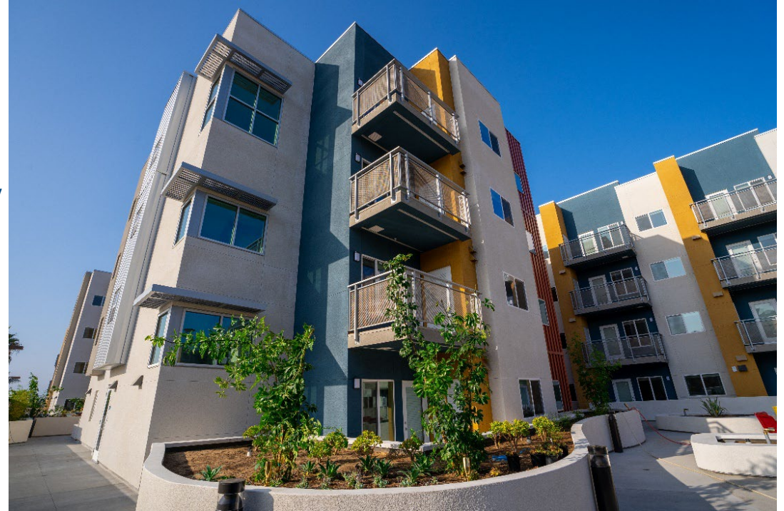
Ventana al Sur – Council District 8 100 affordable housing units, with 25 PBVs for seniors who experienced homelessness Ribbon-cutting: October 10, 2024