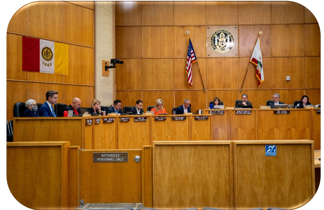
San Diego City Council – February 3, 2025