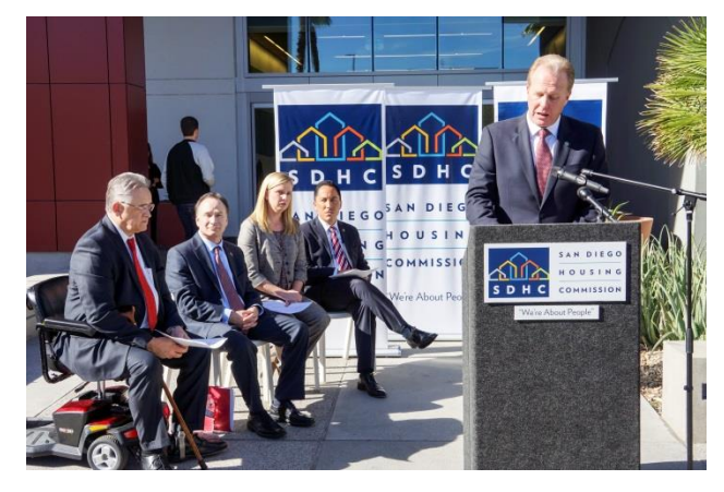
HOUSING FIRST – SAN DIEGO Update San Diego State University 12.03.15