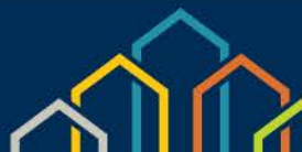
Cypress Apartments 1435 Imperial Ave 62 Affordable Studio Units (New Construction) $600,000 Inclusionary Funds