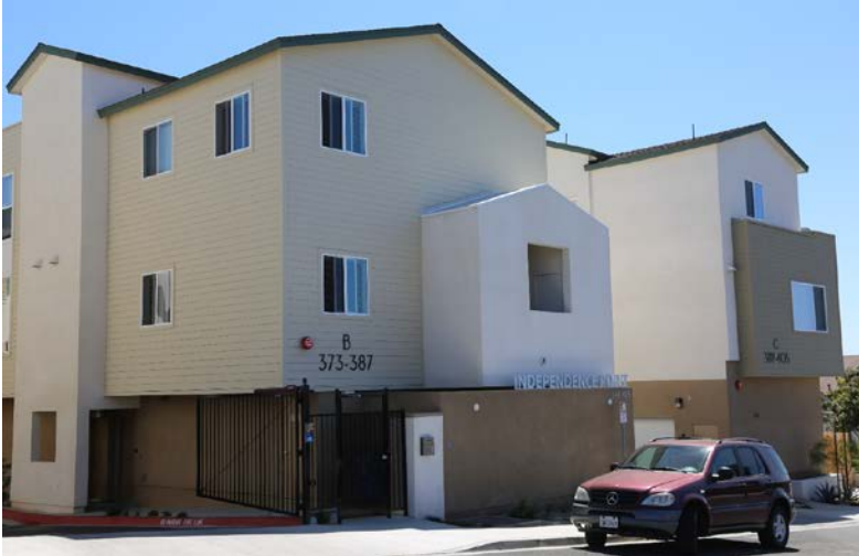
Independence Point 327 S. Willie James Jones Avenue 31 Affordable Units (New Construction) $300,000 Housing Trust Funds