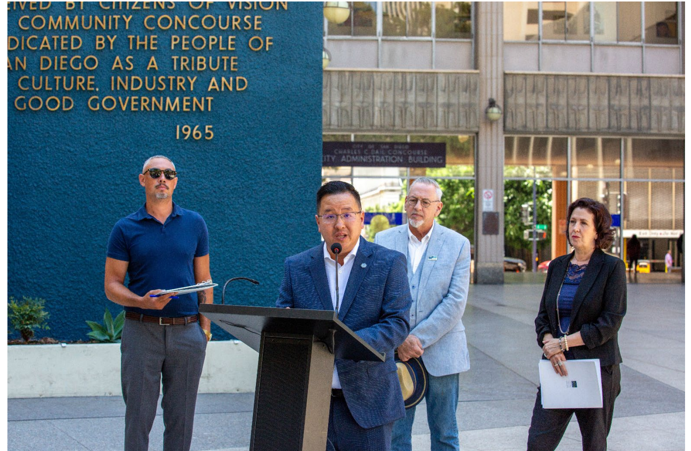
Affordable Housing Preservation Fund News Conference