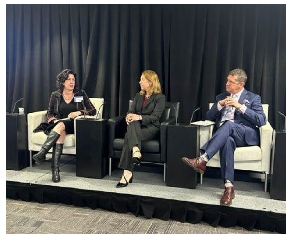
San Diego Regional Chamber of Commerce Panel: A Conversation on Housing