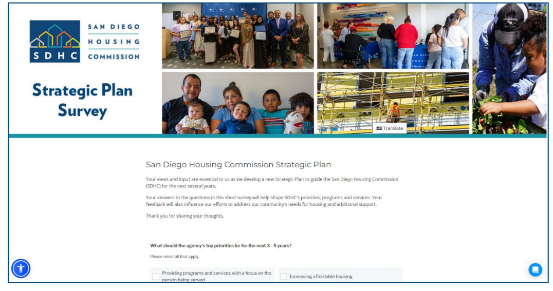
SDHC Strategic Plan – Online Public Survey