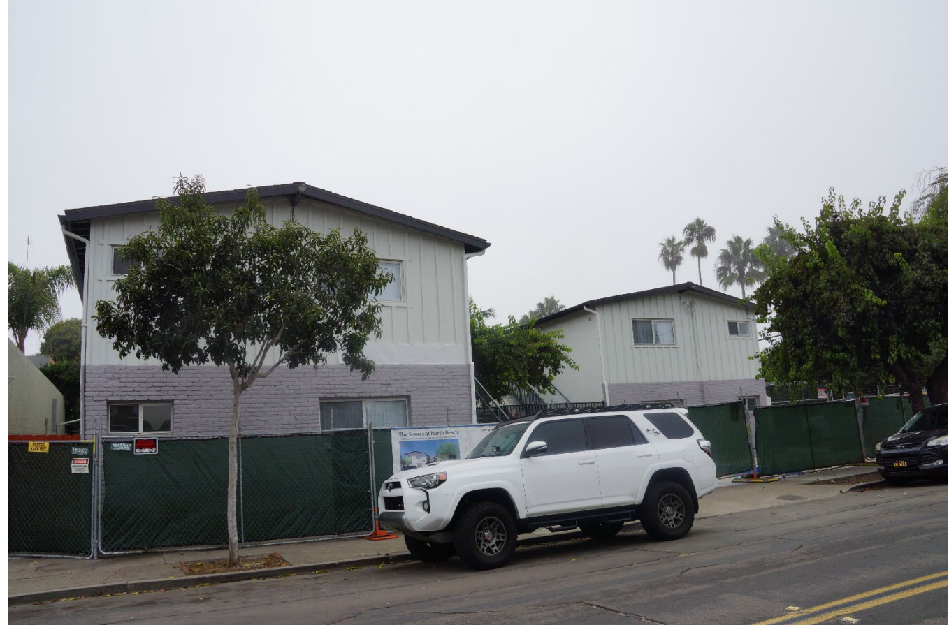
The Shores at North Beach Abbott Street, San Diego, CA 92107 Council District 2