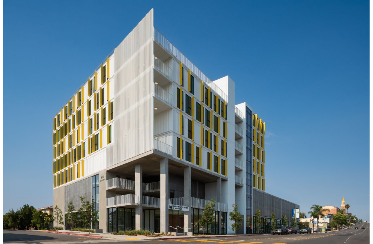
PATH Villas El Cerrito El Cajon Boulevard, San Diego, CA 92115 Council District 9