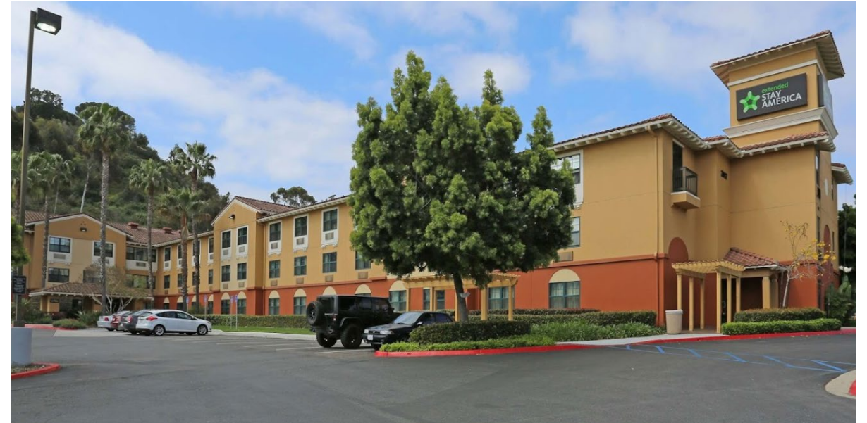
2087 Hotel Circle South, San Diego, CA 92108